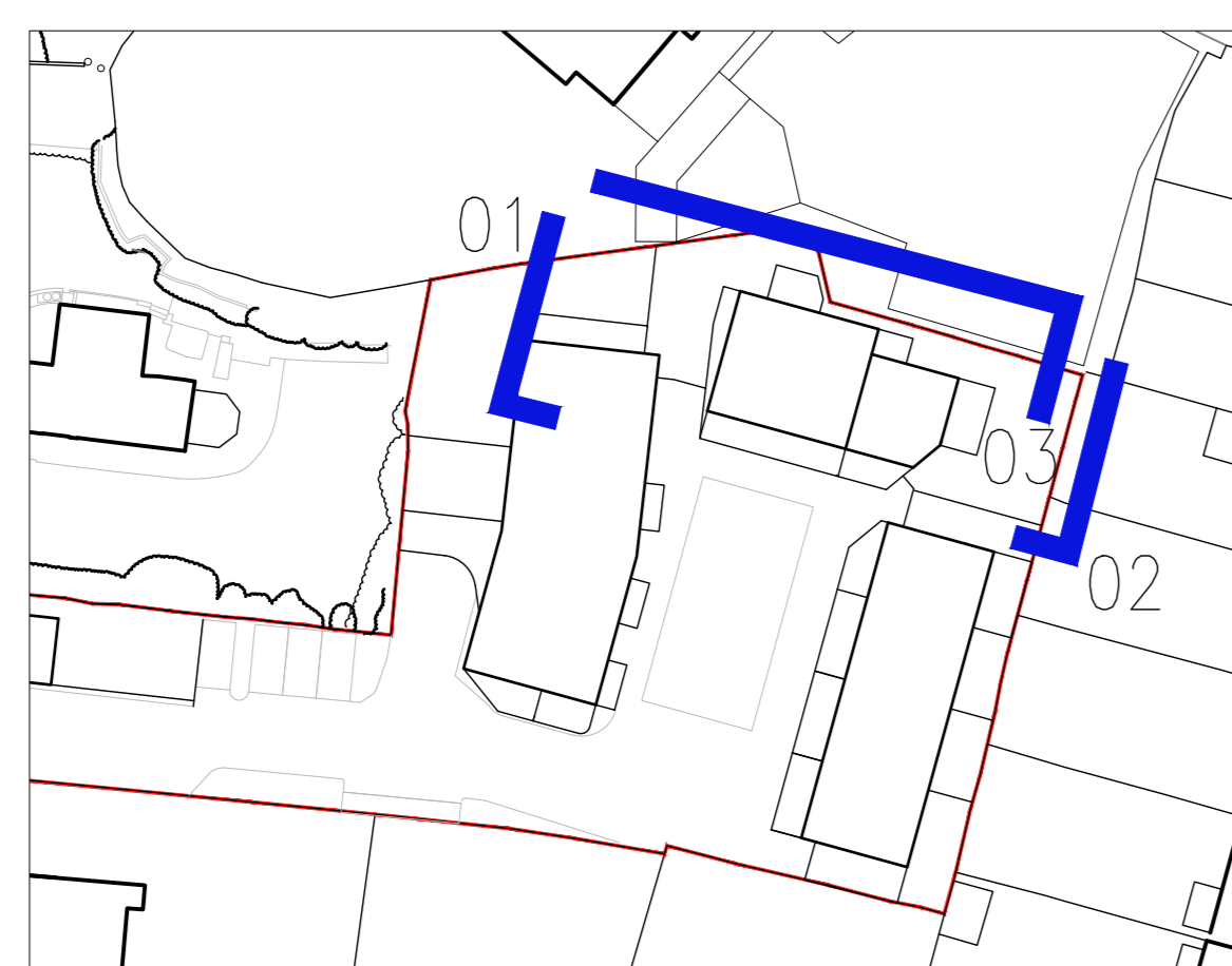
KEY PLAN :