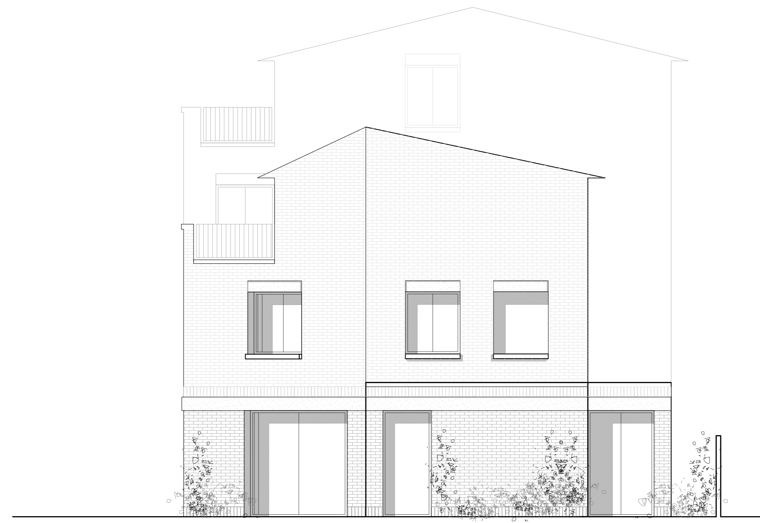
EASTERN ELEVATION :