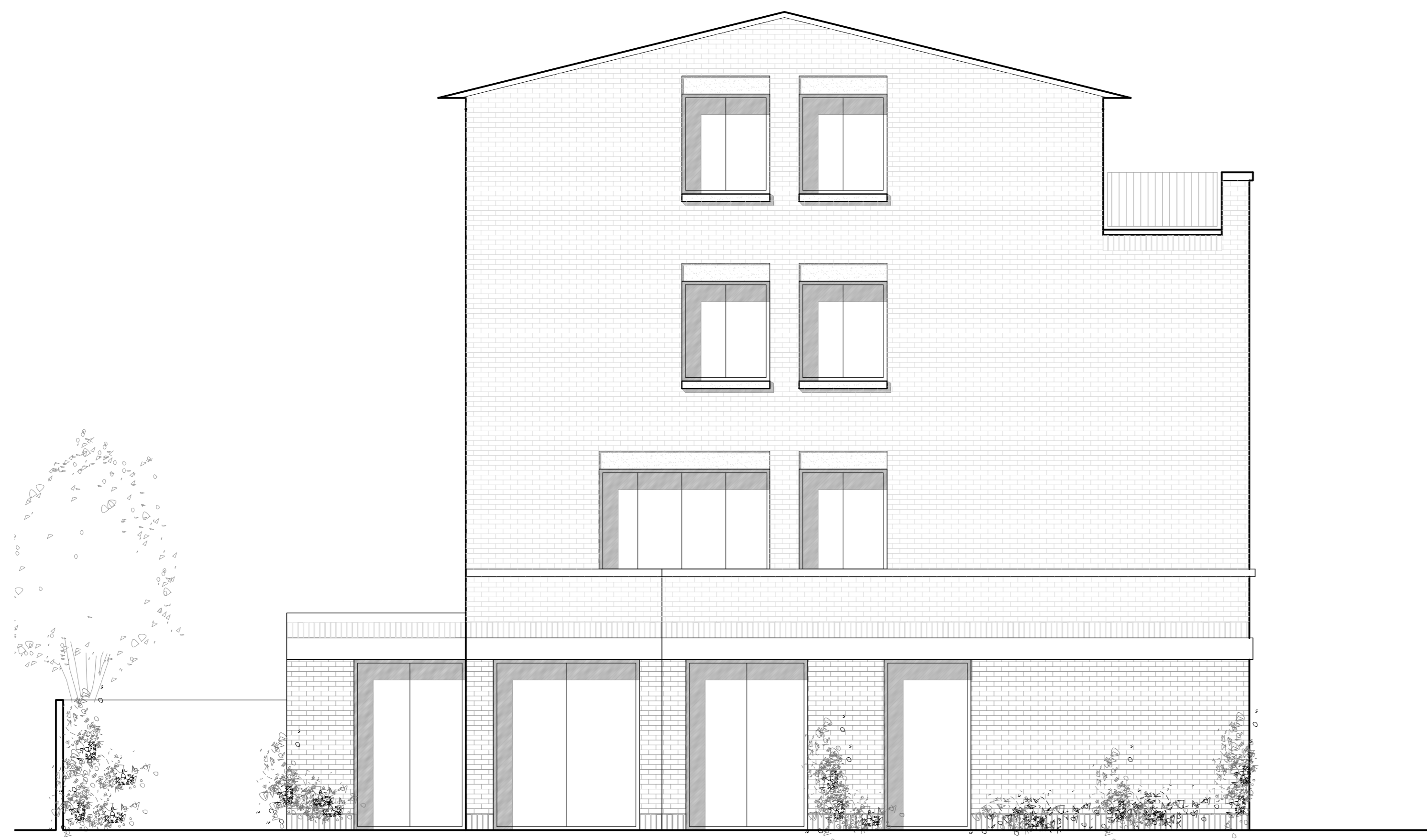
WESTERN ELEVATION :