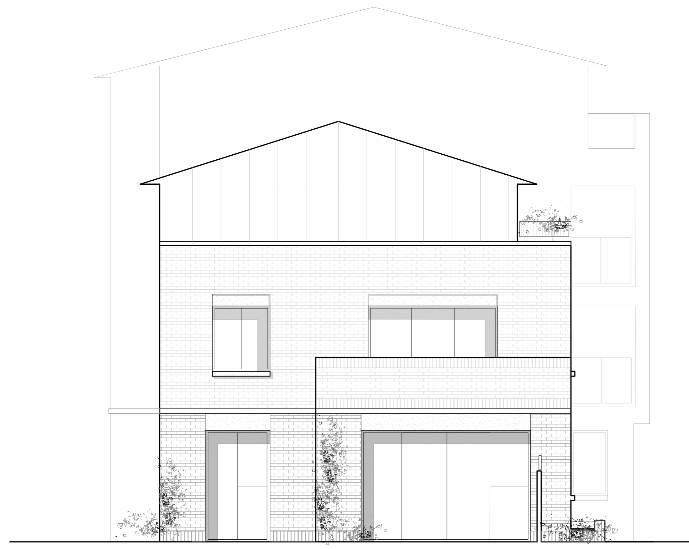
NORTHERN ELEVATION :