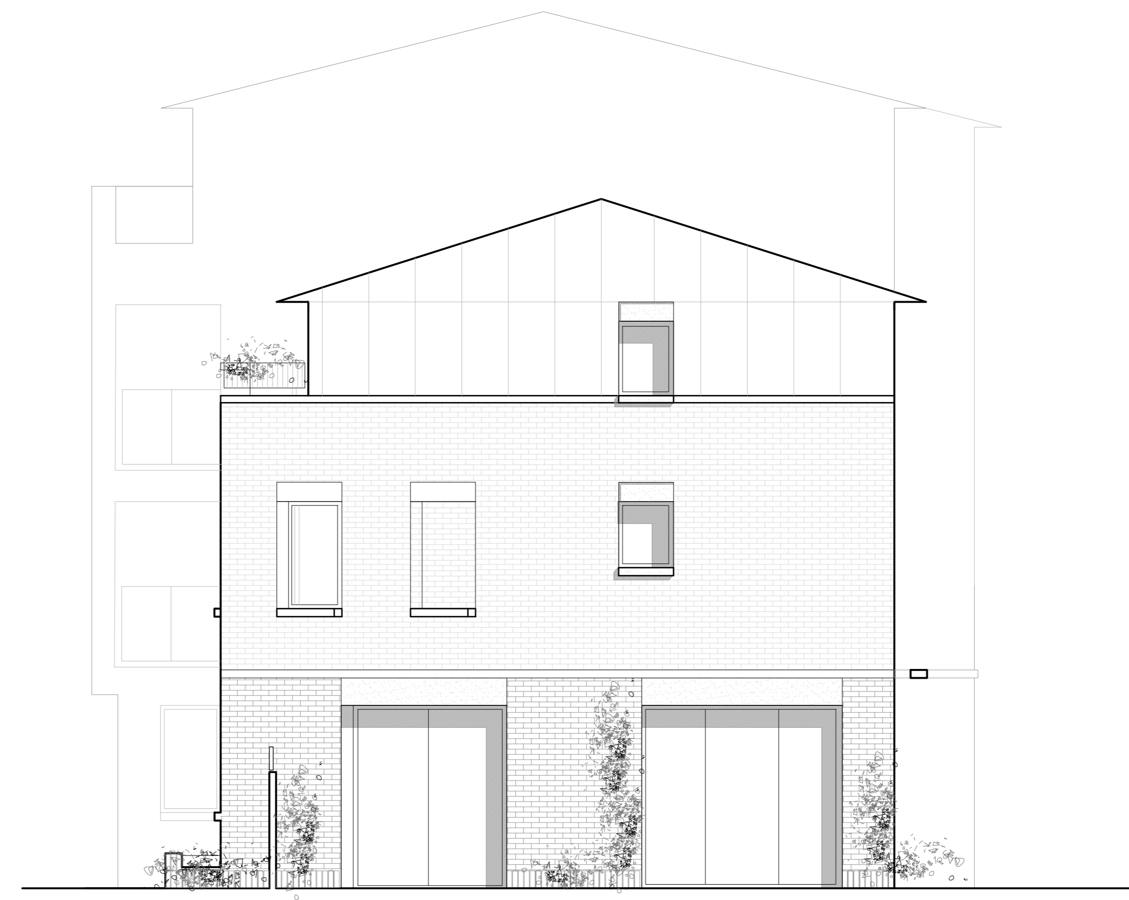
SOUTHERN ELEVATION :