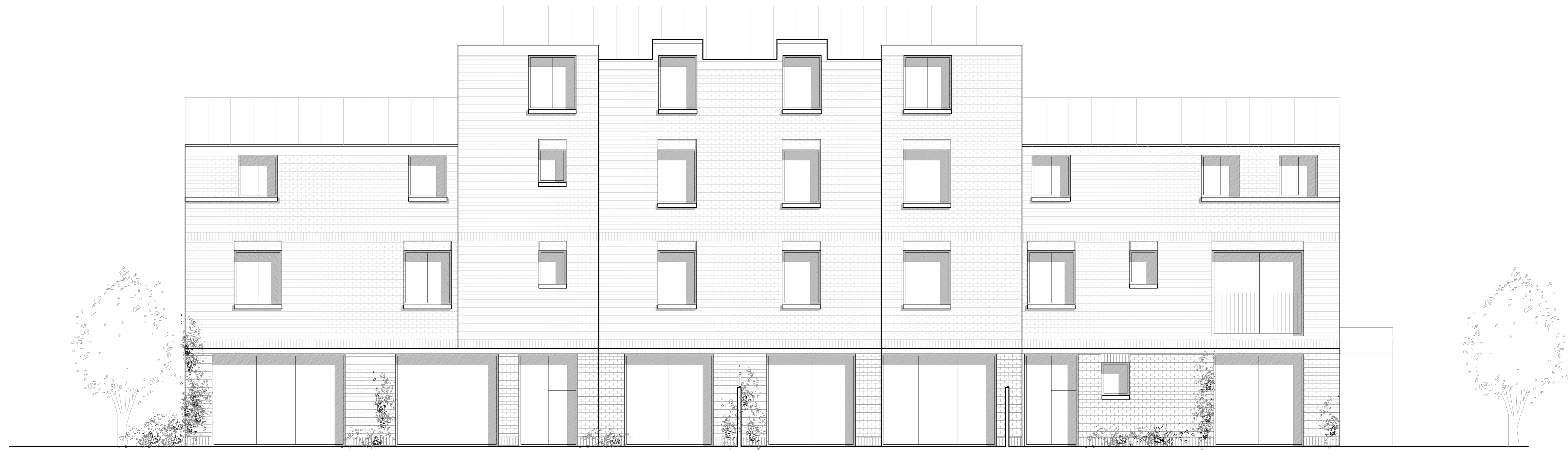
REAR ELEVATION :

ALL DIMENSIONS MUST BE CHECKED ON SITE. INFORM THE ARCHITECT OF ANY DISCREPANCIES PRIOR TO CONSTRUCTION. INTERNAL LAYOUTS INDICATIVE.