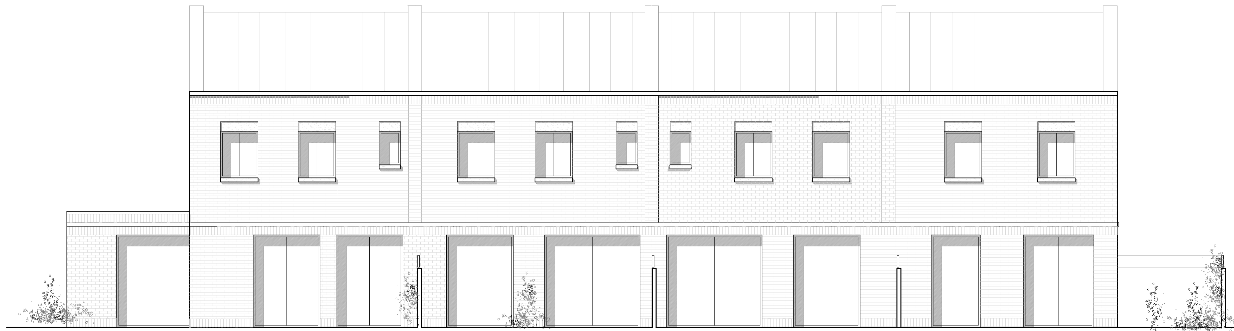
REAR ELEVATION :

ALL DIMENSIONS MUST BE CHECKED ON SITE. INFORM THE ARCHITECT OF ANY DISCREPANCIES PRIOR TO CONSTRUCTION INTERNAL LAYOUTS INDICATIVE