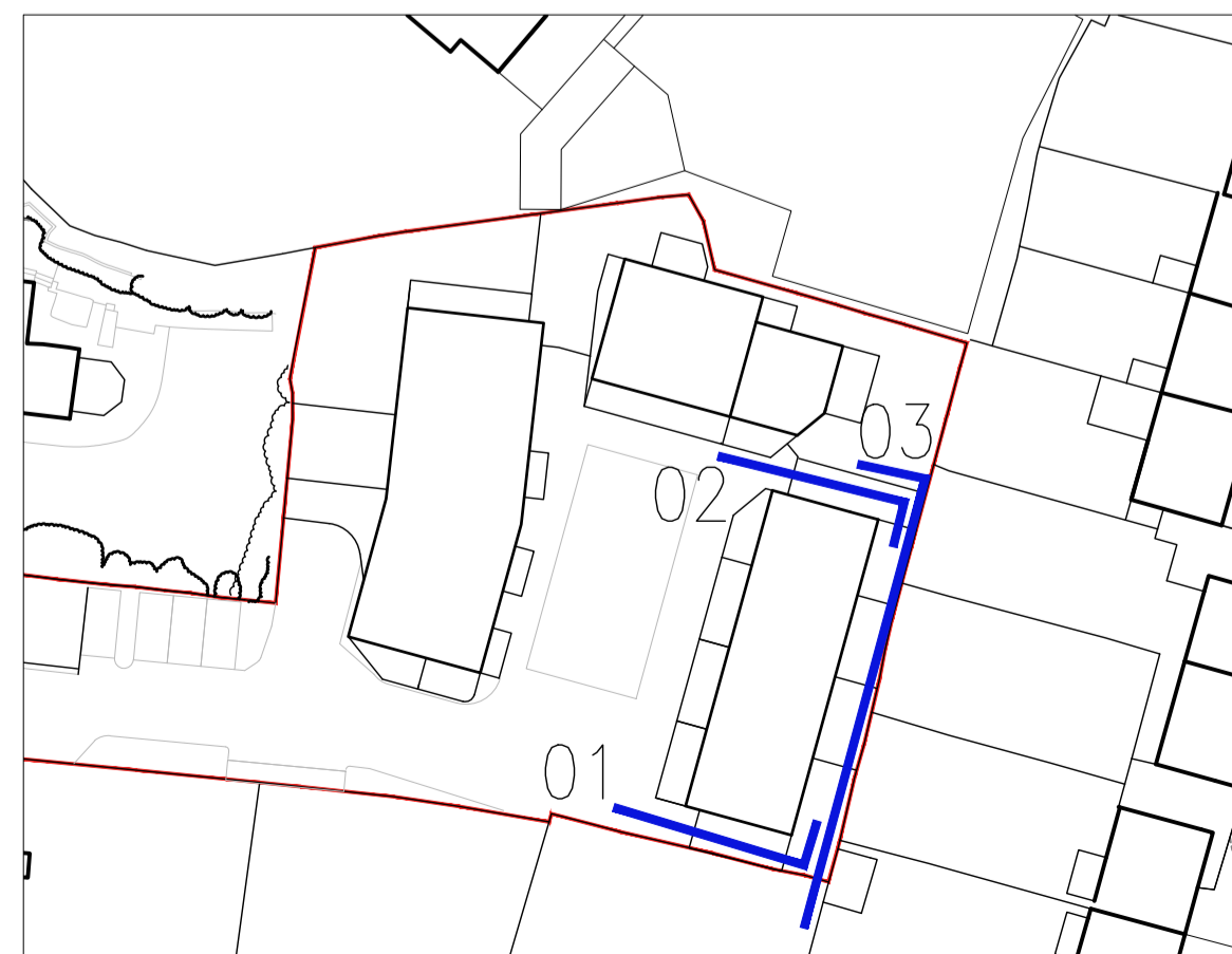
KEY PLAN :