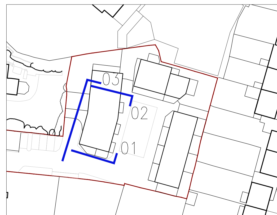
KEY PLAN :

ALL DIMENSIONS MUST BE CHECKED ON SITE. INFORM THE ARCHITECT OF ANY DISCREPANCIES PRIOR TO CONSTRUCTION INTERNAL LAYOUTS INDICATIVE