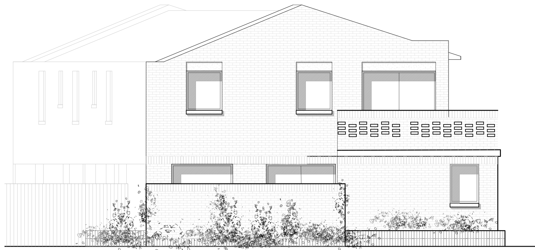
SOUTHERN ELEVATION :