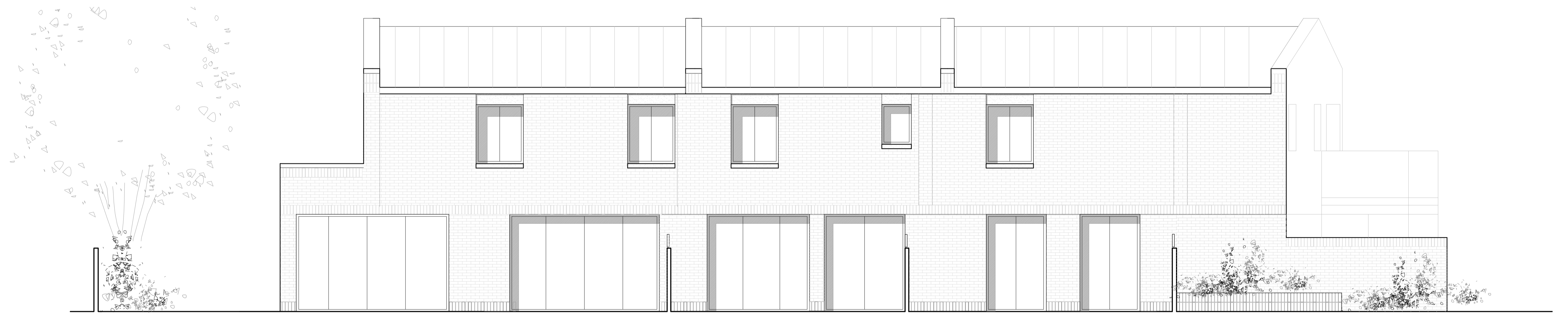
REAR ELEVATION :