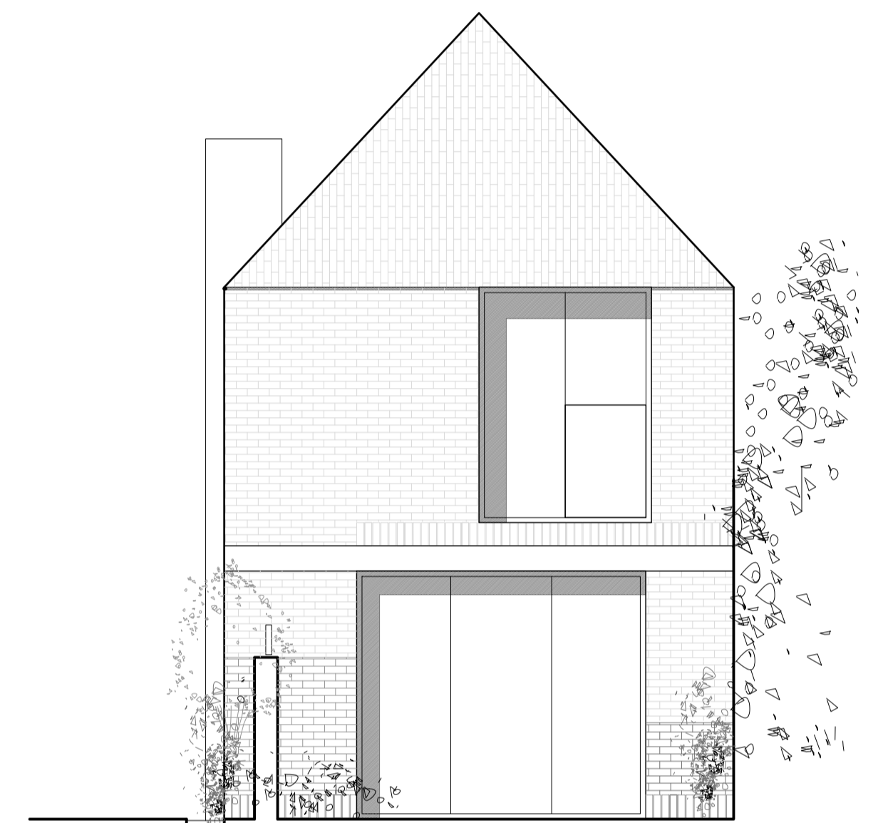
UNIT 01 : REAR ELEVATION

ALL DIMENSIONS MUST BE CHECKED ON SITE. INFORM THE ARCHITECT OF ANY DISCREPANCIES PRIOR TO CONSTRUCTION INTERNAL LAYOUTS INDICATIVE