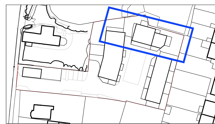
KEY PLAN :