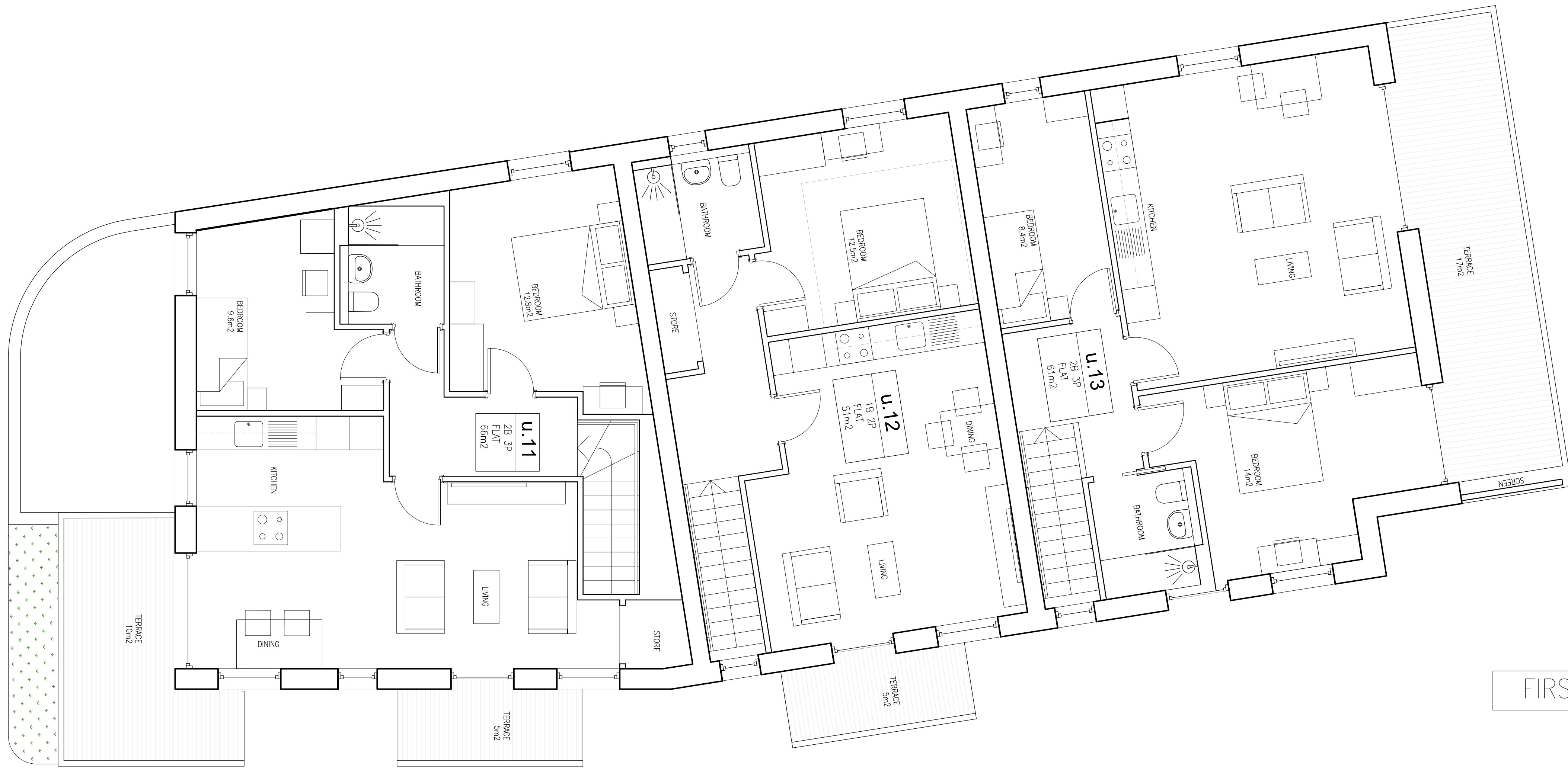
FIRST FLOOR :