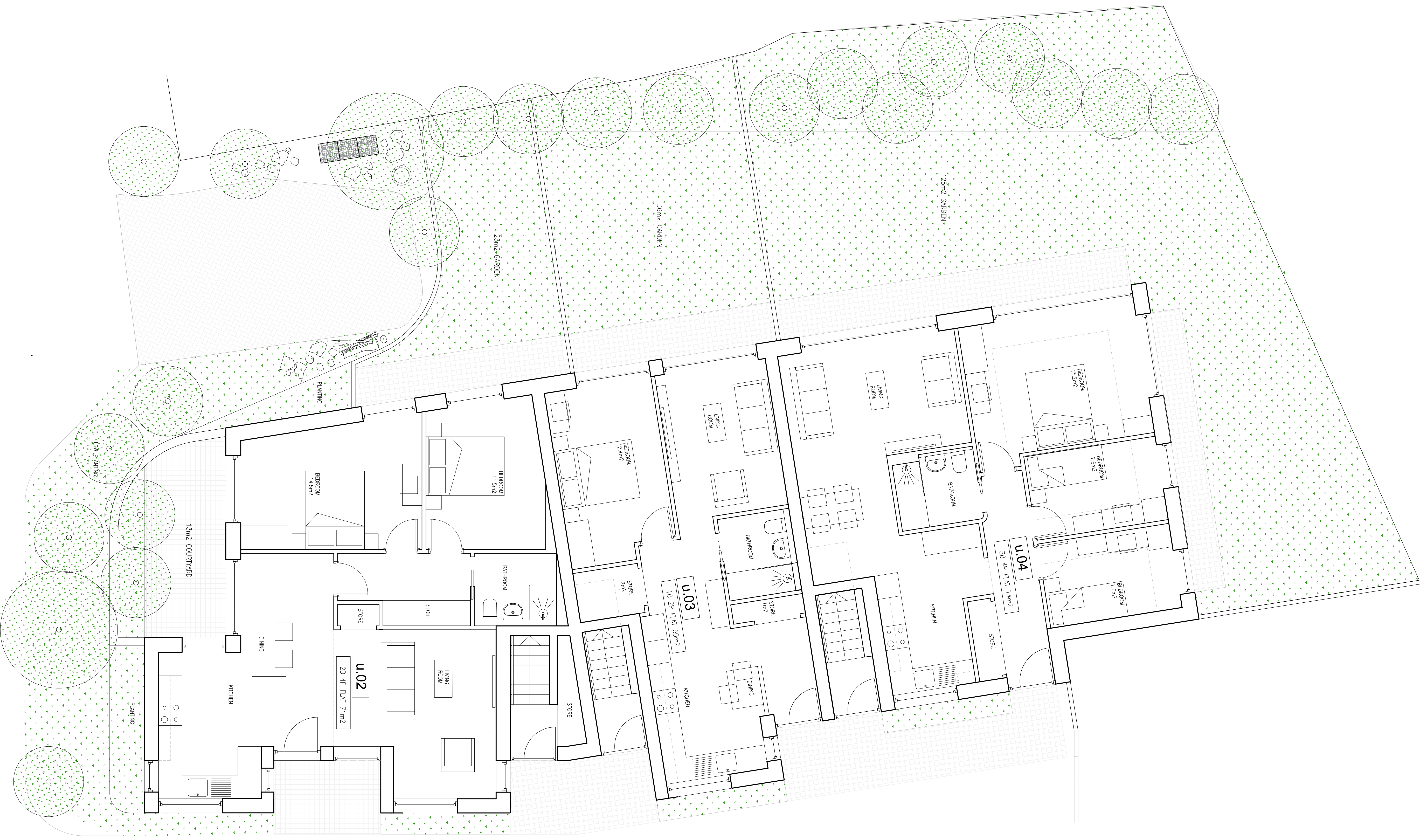
GROUND FLOOR :