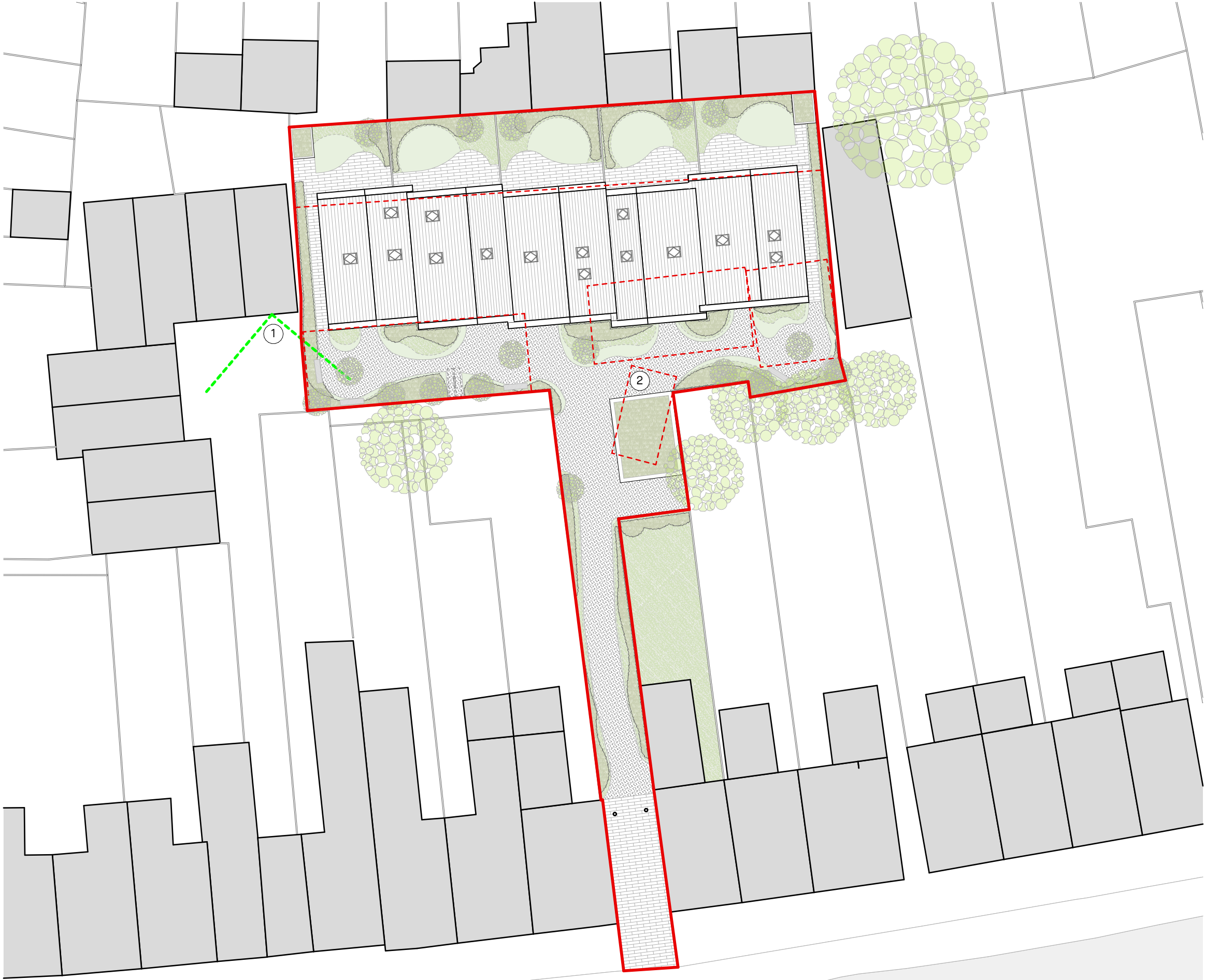
1:250 Proposed Site Plan + Roof