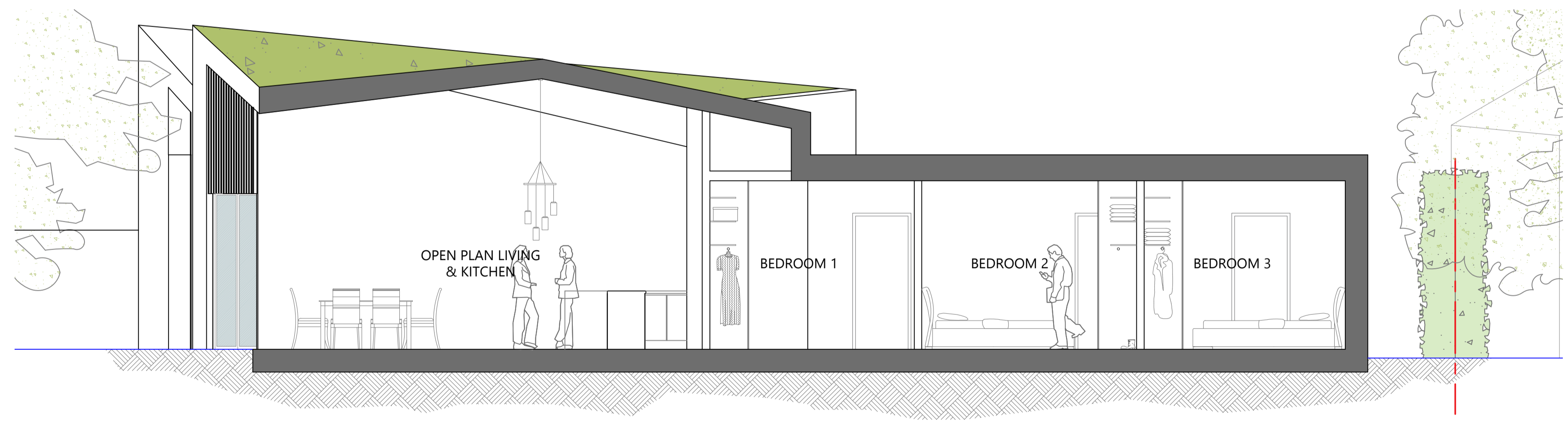
PROPOSED Section AA