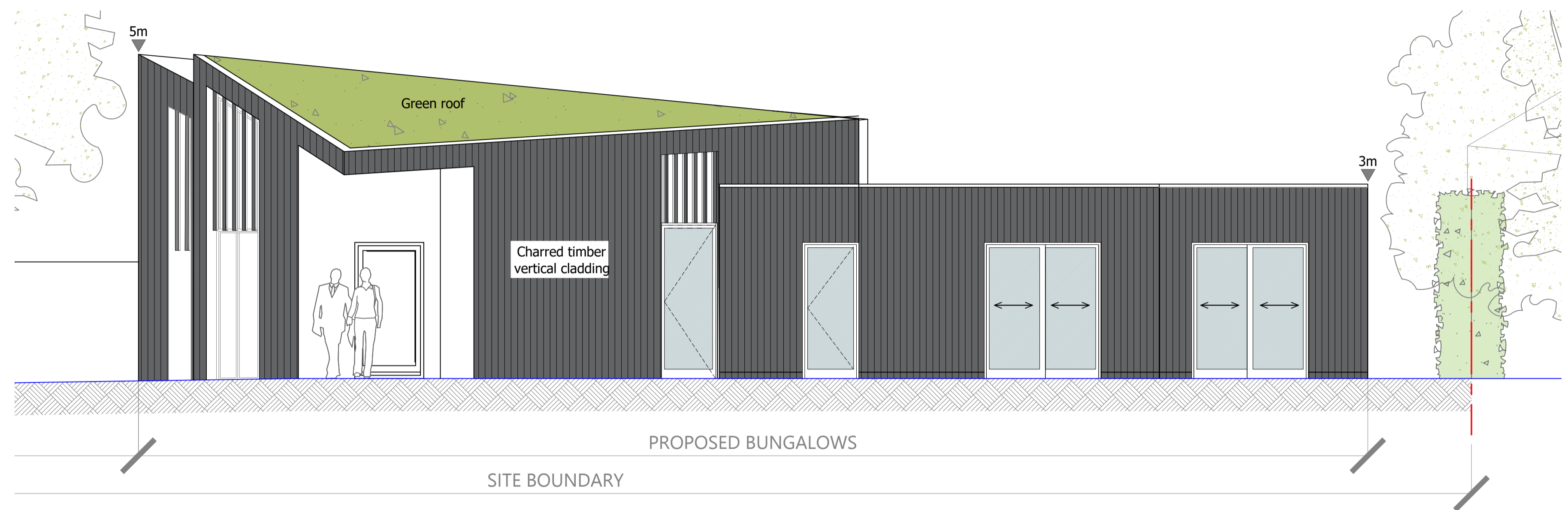
PROPOSED South East Elevation (Side)