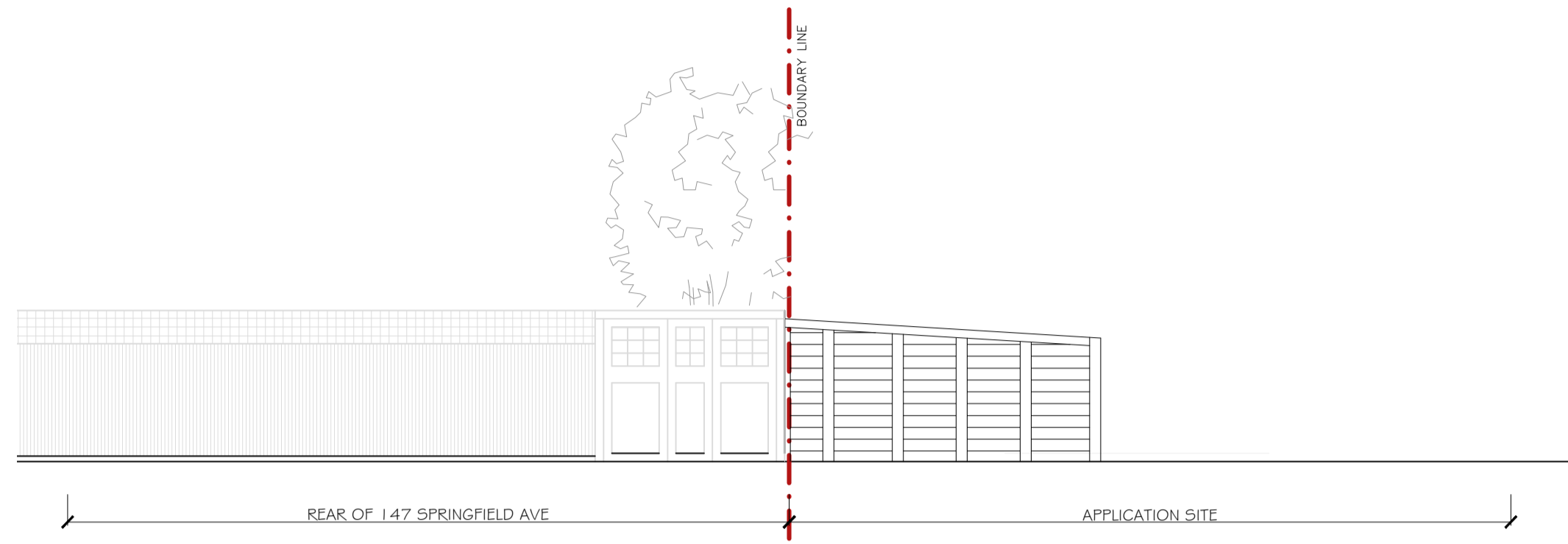
EXISTING ELEVATION NO.1 @SCALE 1:100