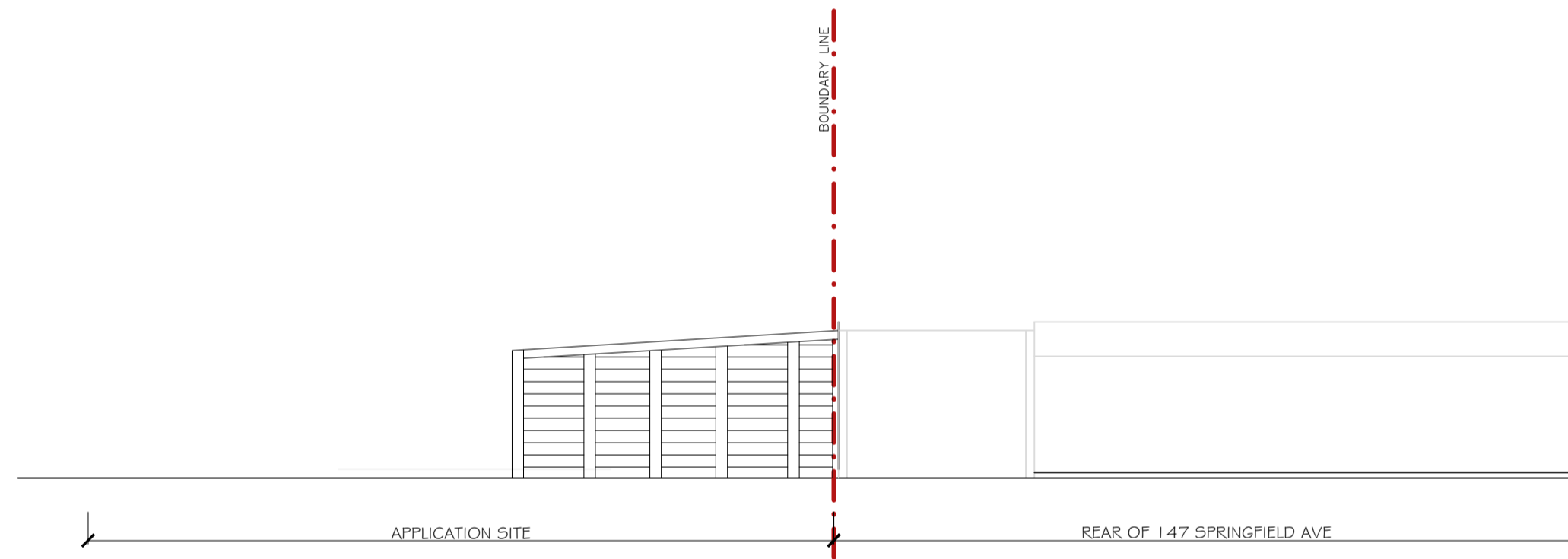
EXISTING ELEVATION NO.3 @SCALE 1:100