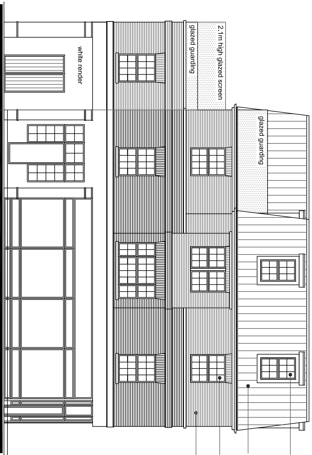
Front Elevation (west) Durham Road Elevation

white upvc windows to match existing zinc roof white upvc windows to match existing red brick to match existing