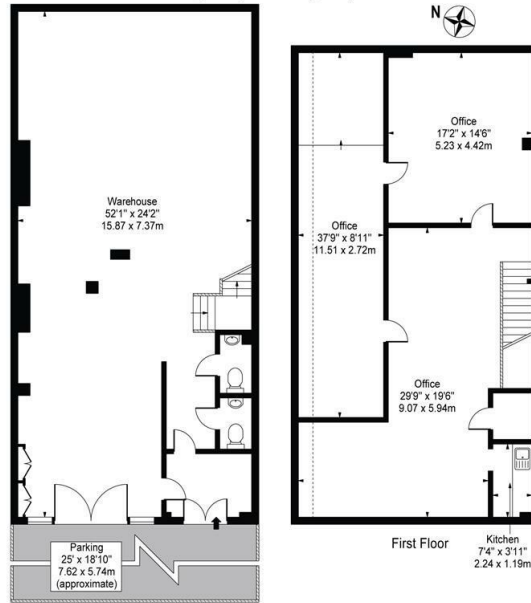
Ground Floor For Illustration Purposes Only - Not To Scale - Floor Plan by interDesign Photography www.interdesignphotography.com

Enviro Flame, Lyon Road, Business Centre, SW19 2RL Approx. Total Internal Area 2392 Sq Ft - 222.22 Sq M (Including Restricted Height Area) Approx. Gross Internal Area 2321 Sq Ft - 215.63 Sq M (Excluding Restricted Height Area)