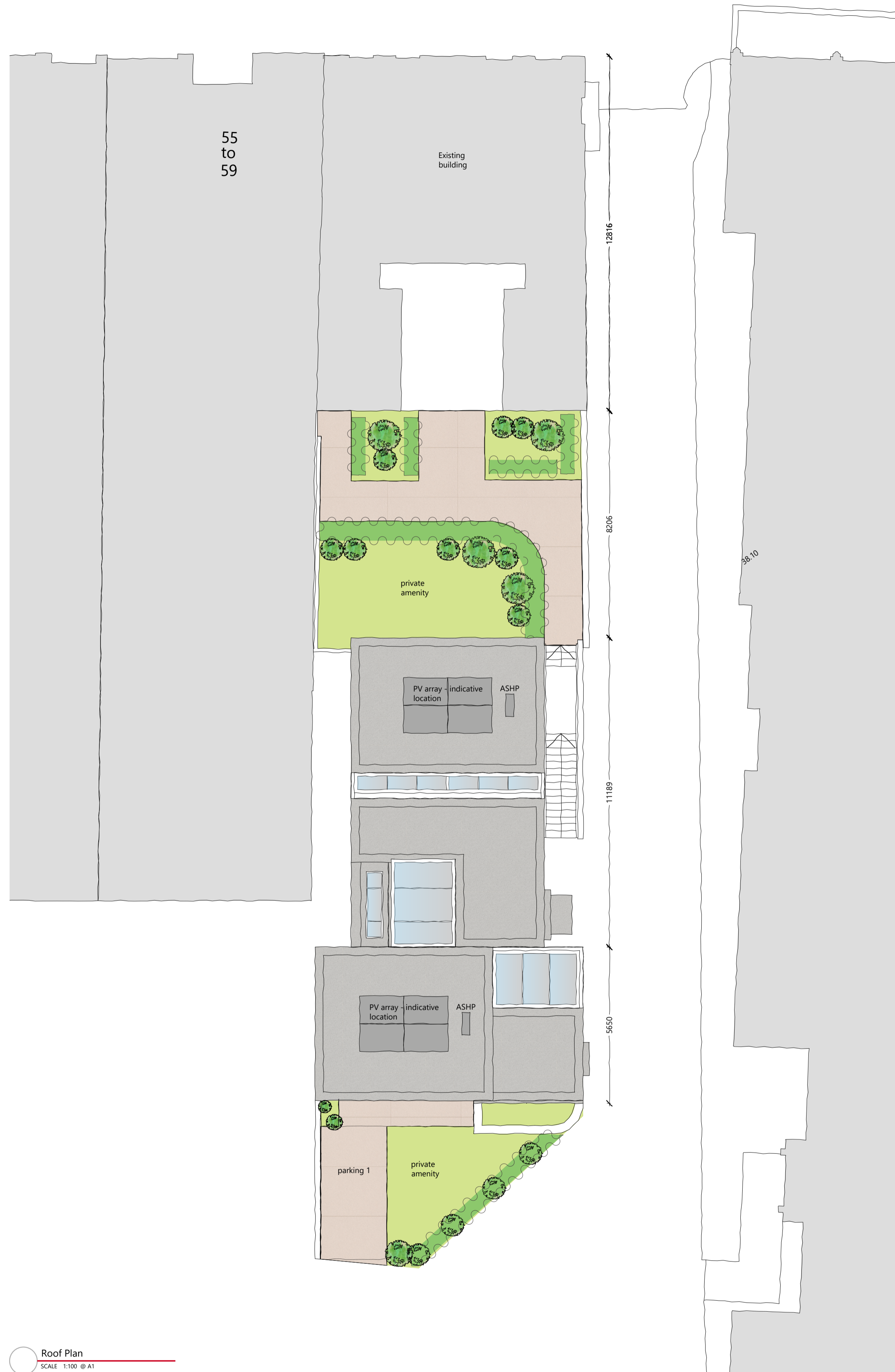
Roof Plan SCALE 1:100 @ A1

PLANNING ISSUE The drawing and design is for use only in connection with the project described. The drawing and design is the property of Lytle Associates Architects and must not be reissued, loaned, copied, or otherwise used without the prior written consent of Lytle Associates Architects. The drawing is to be read in conjunction with all other information relevant to the project. Any apparent discrepancy is to be brought to the attention of Lytle Associates Architects. © Lytle Associates Architects