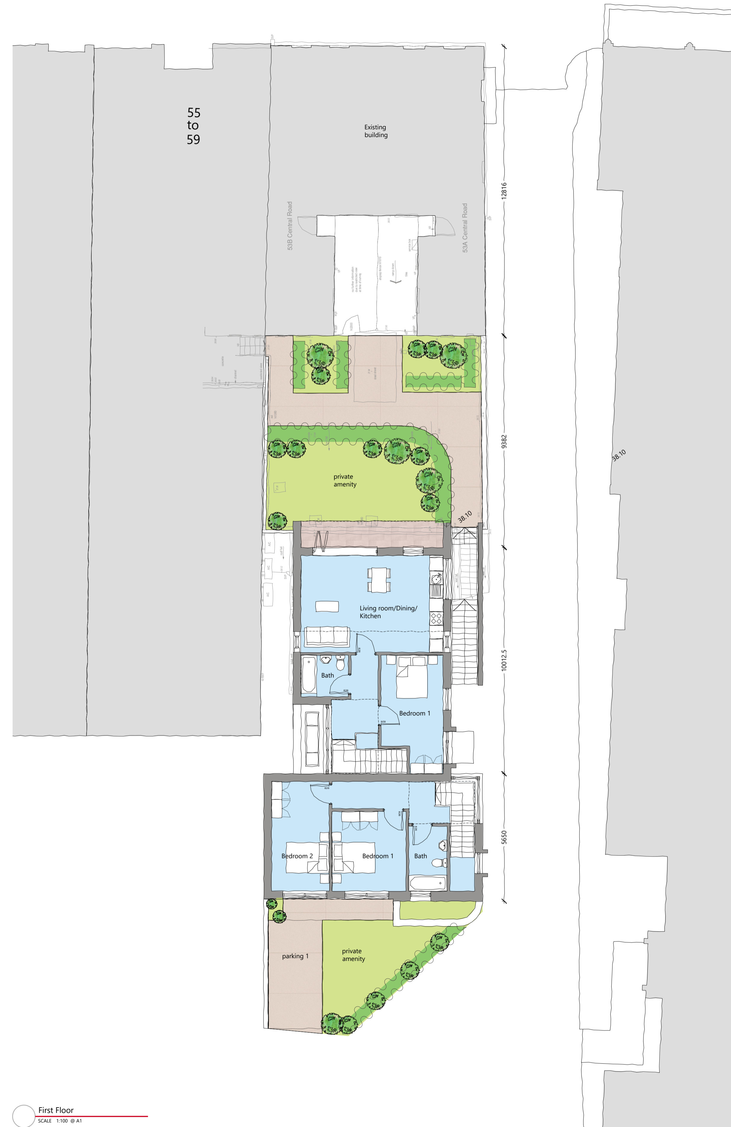
First Floor SCALE 1:100 @ A1