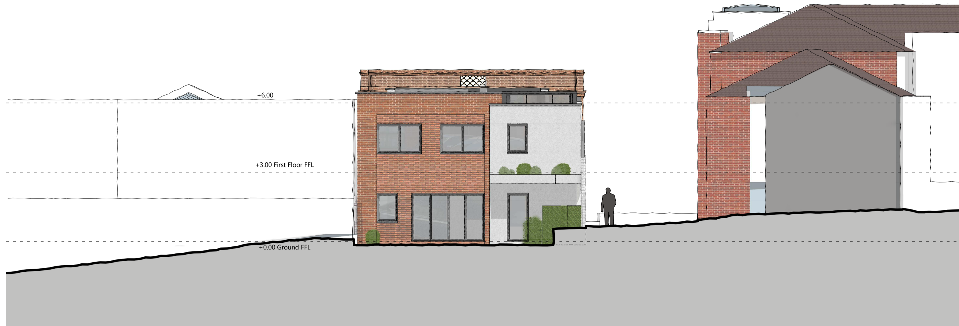
South West Elevation SCALE 1:100 @ A1