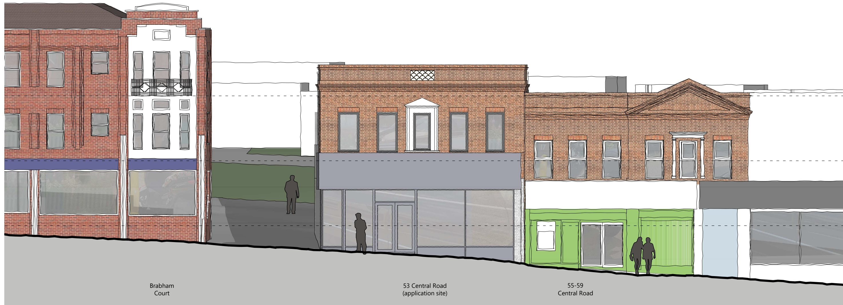
North East Elevation SCALE 1:100 @ A1