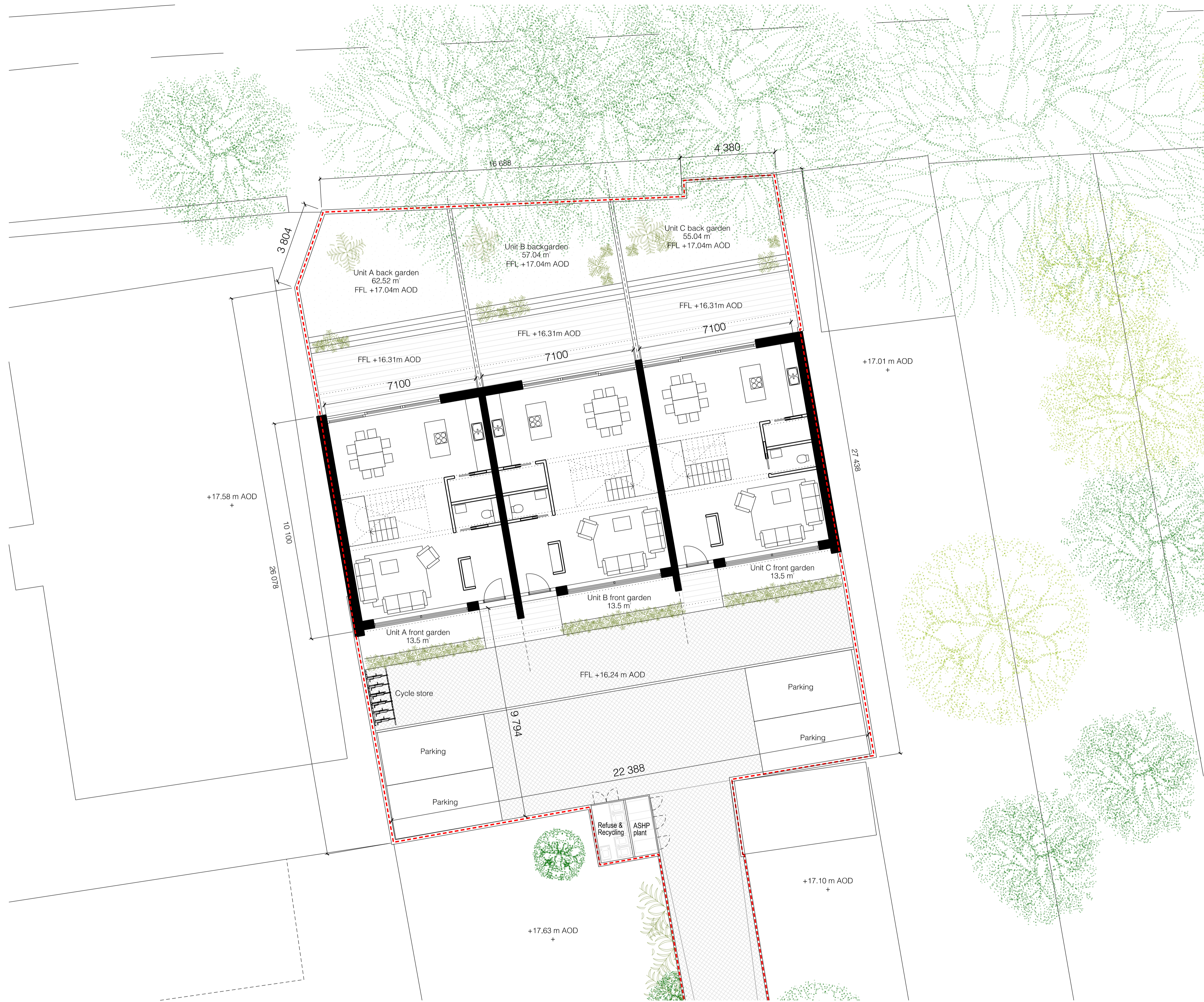
1 Proposed Ground Floor Plan

Do not scale dimensions. Dimensions govern. All dimensions are in millimetres unless noted otherwise. Moll Architects shall be notified in writing of any discrepancies.