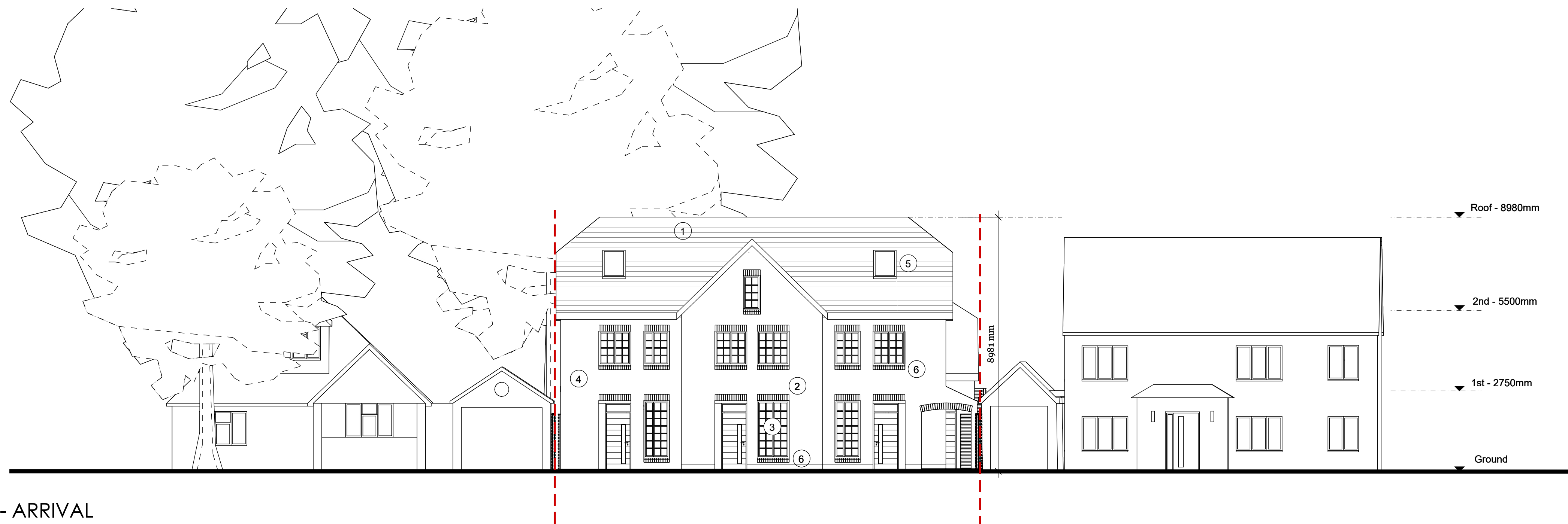
NORTH ELEVATION - ARRIVAL 1:100 @ A1/ 1:200@A3