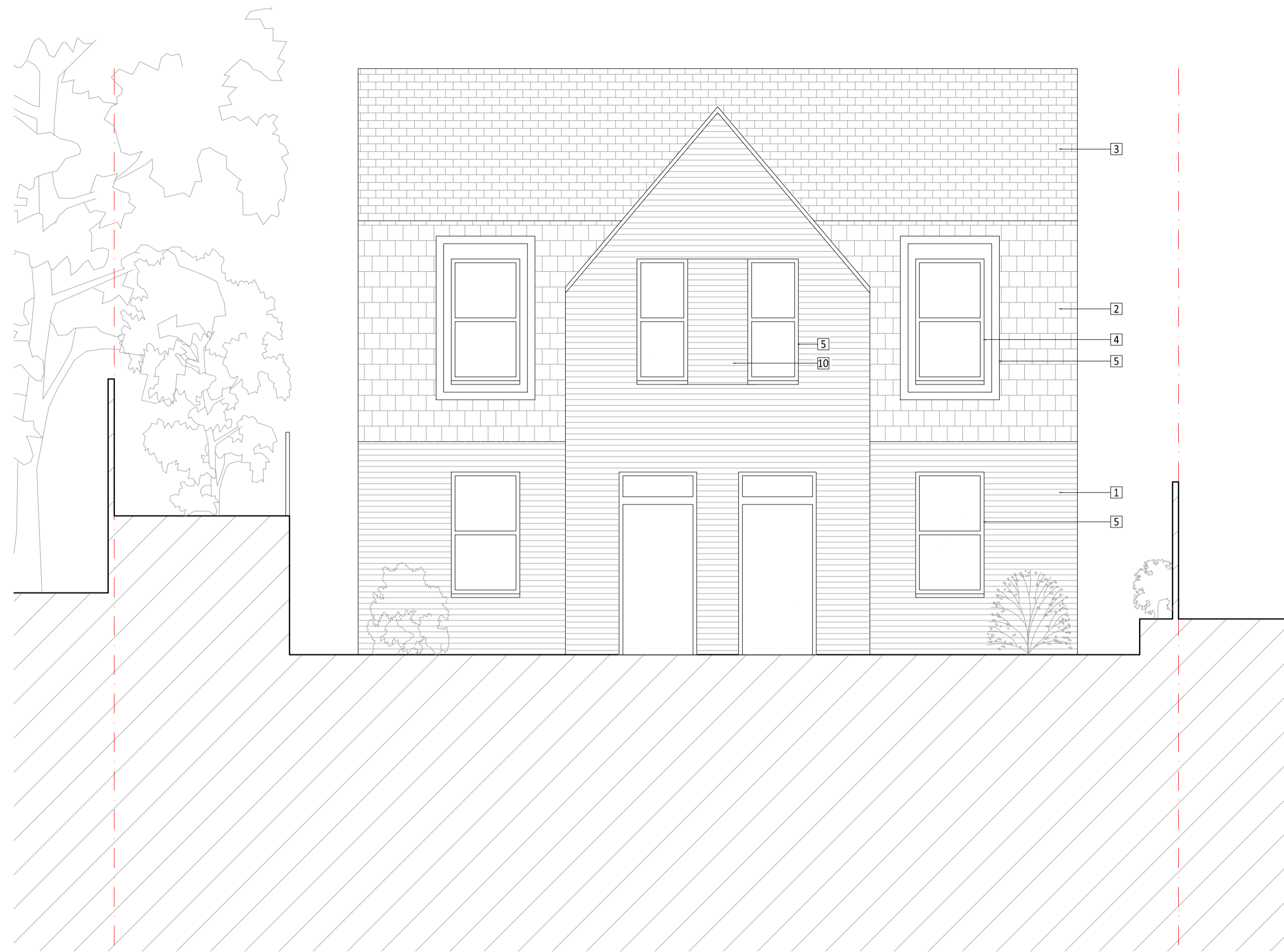
E-1 Front Elevation Scale 1:50