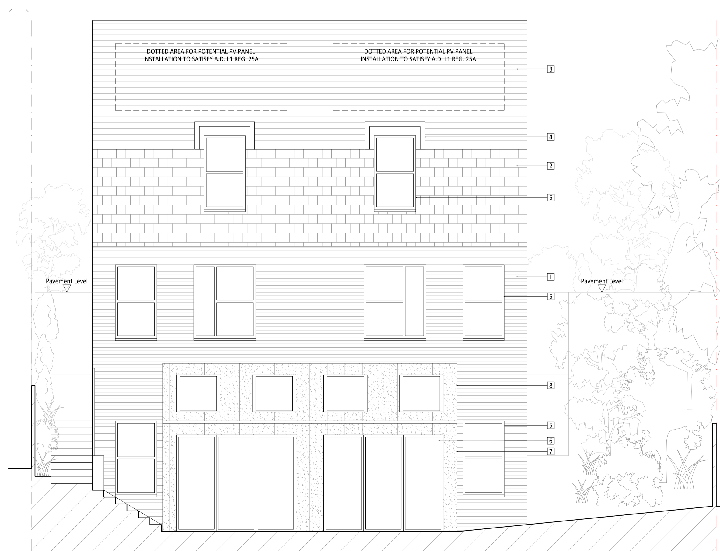
E-3 Rear Elevation Scale 1:50