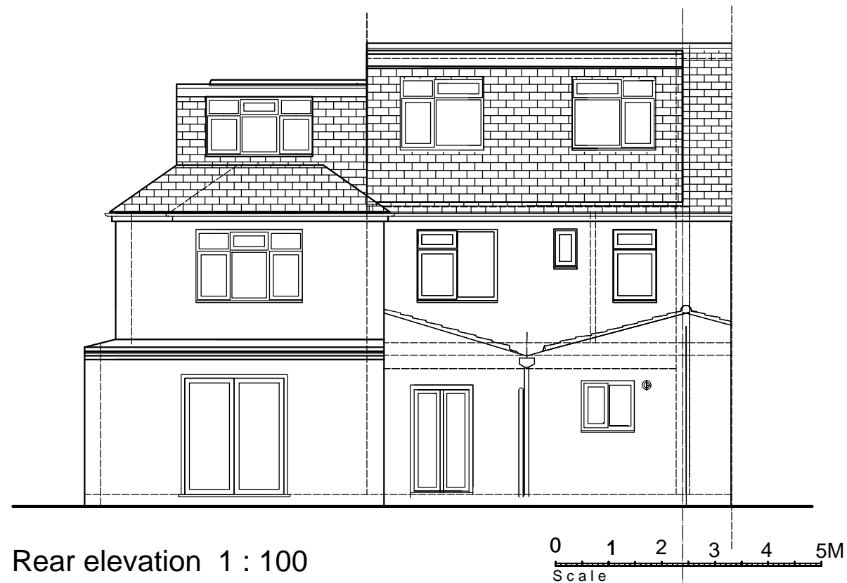
Rear elevation 1 : 100