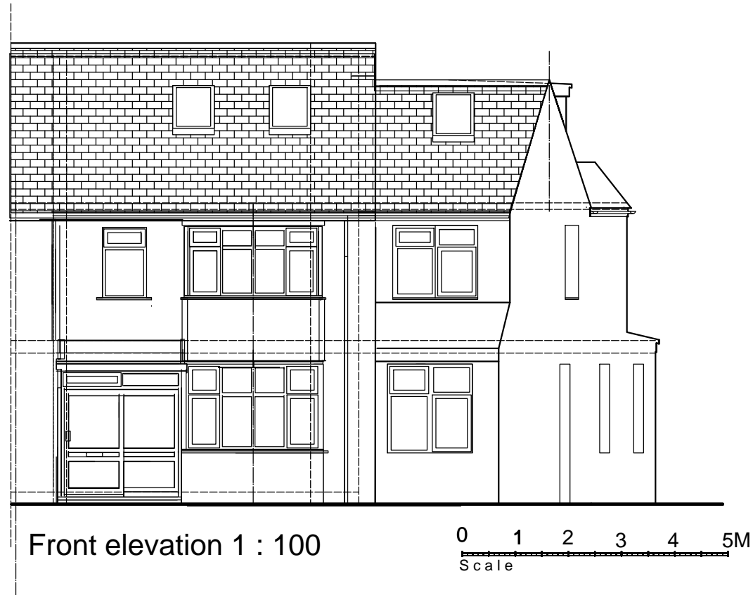
Front elevation 1 : 100

Application for Planning Permission Town and Country Planning Act 1990 (as amended) in accordance with the legislation 'The Town and Country Planning (Development Management Procedure) (England) Order 2015 (as amended).