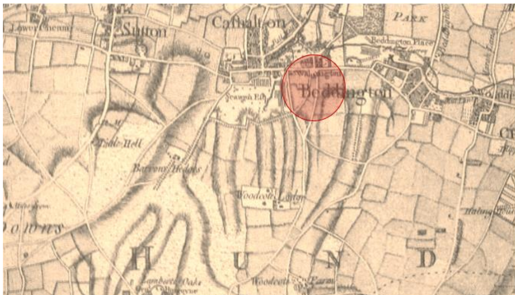
Figure 3: Rocque's map of Surrey (c1760)