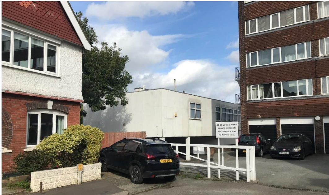
Figure 12 – The application site as viewed from Lodge Road (Site Visit, 2019)