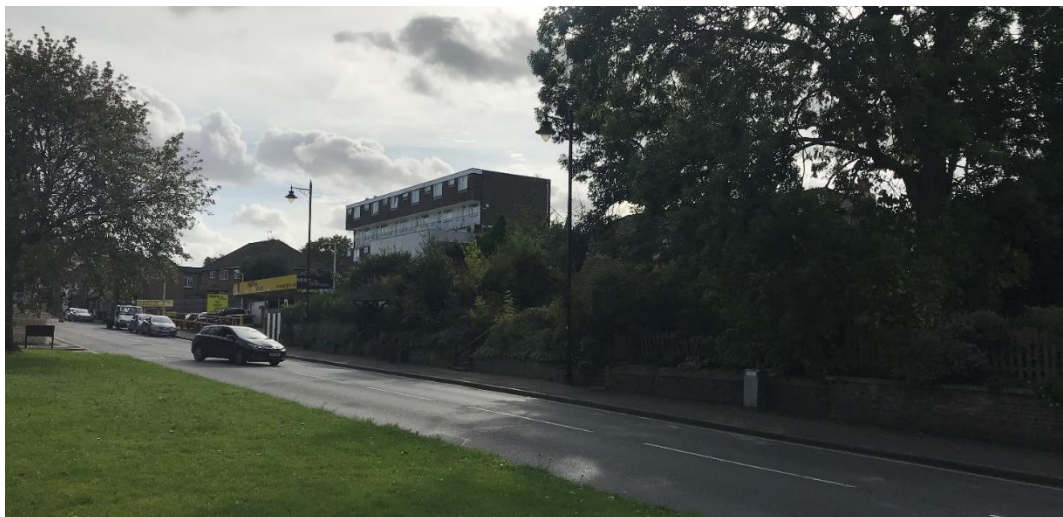
Figure 11 – Manor Road looking south west towards the application site from the east side. The location of the proposed new building will not be visible from Manor Road due to the existing tree planting and built form. (Site Visit, 2019)