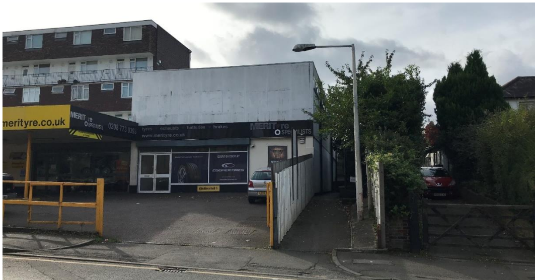
Figure 9 – View towards the application site from Manor Road. The application site is not visible from Manor Road. (Site Visit, 2019)