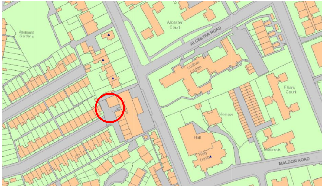
Figure 1 – Historic England Map, Site marked in red, Listed Buildings marked with blue icons