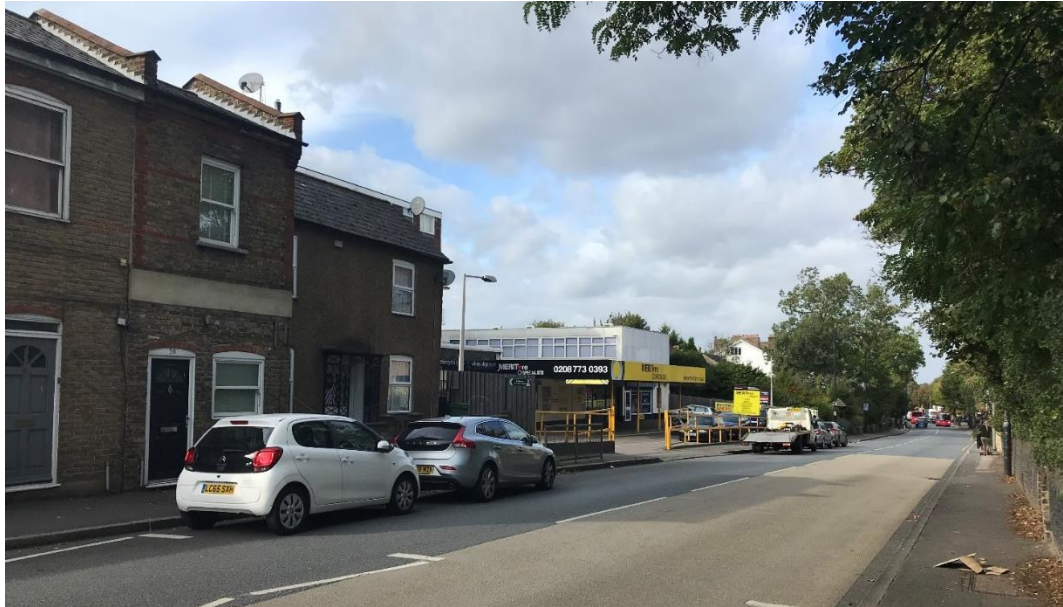
Figure 8 – View looking north along Manor Road from the east side (Site Visit, 2019). The application site is to the rear of this building and is not visible from Manor Road.