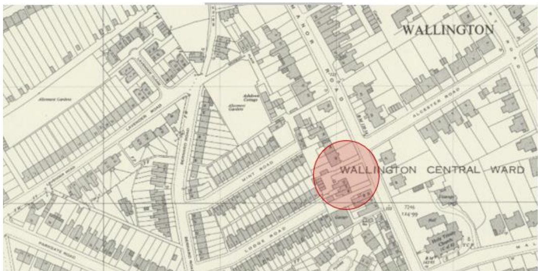
Figure 7: OS Map (1957)