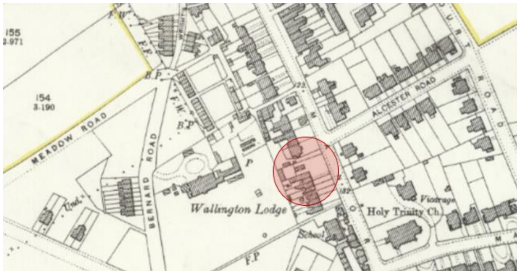
Figure 4: OS Map (1896)