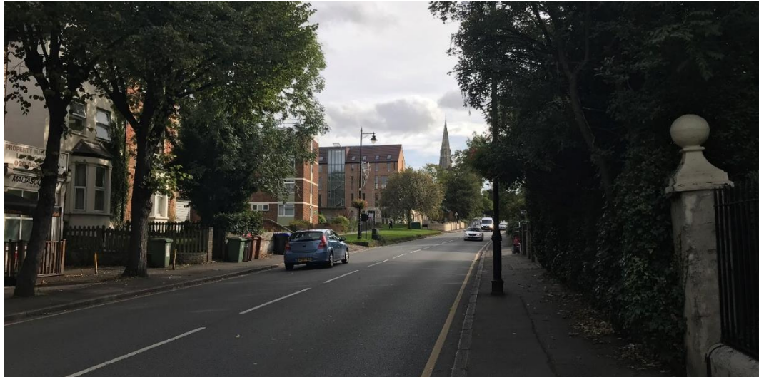
Figure 10 – Manor Road looking south from the west side (Site Visit, 2019)