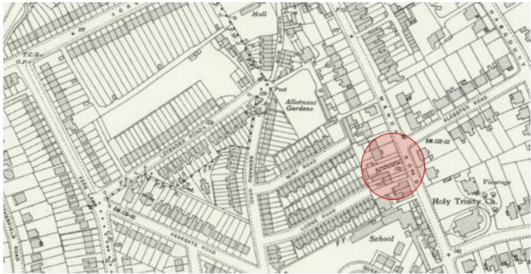
Figure 6: OS Map (1916)