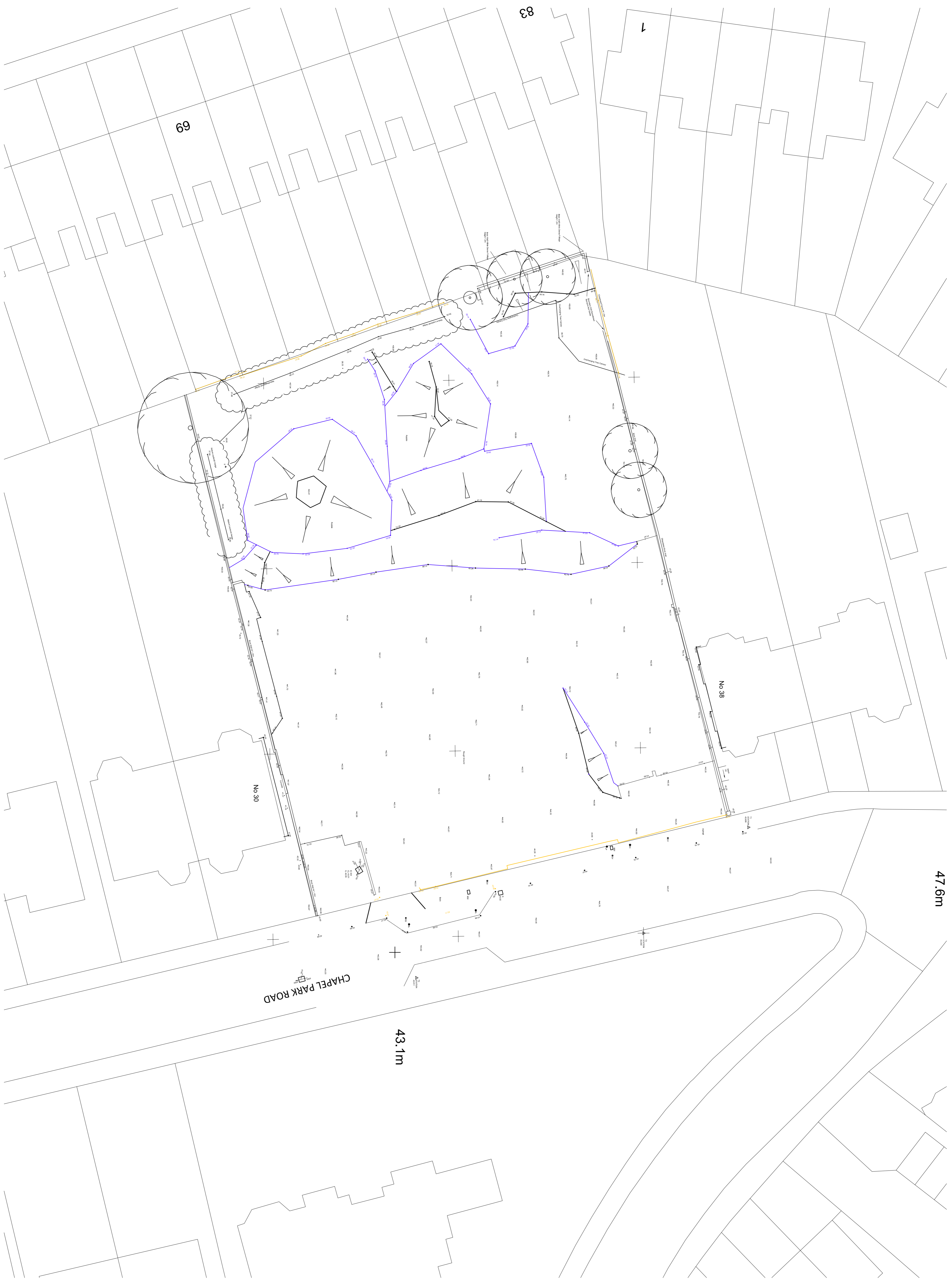
Existing Site Plan Scale 1:200