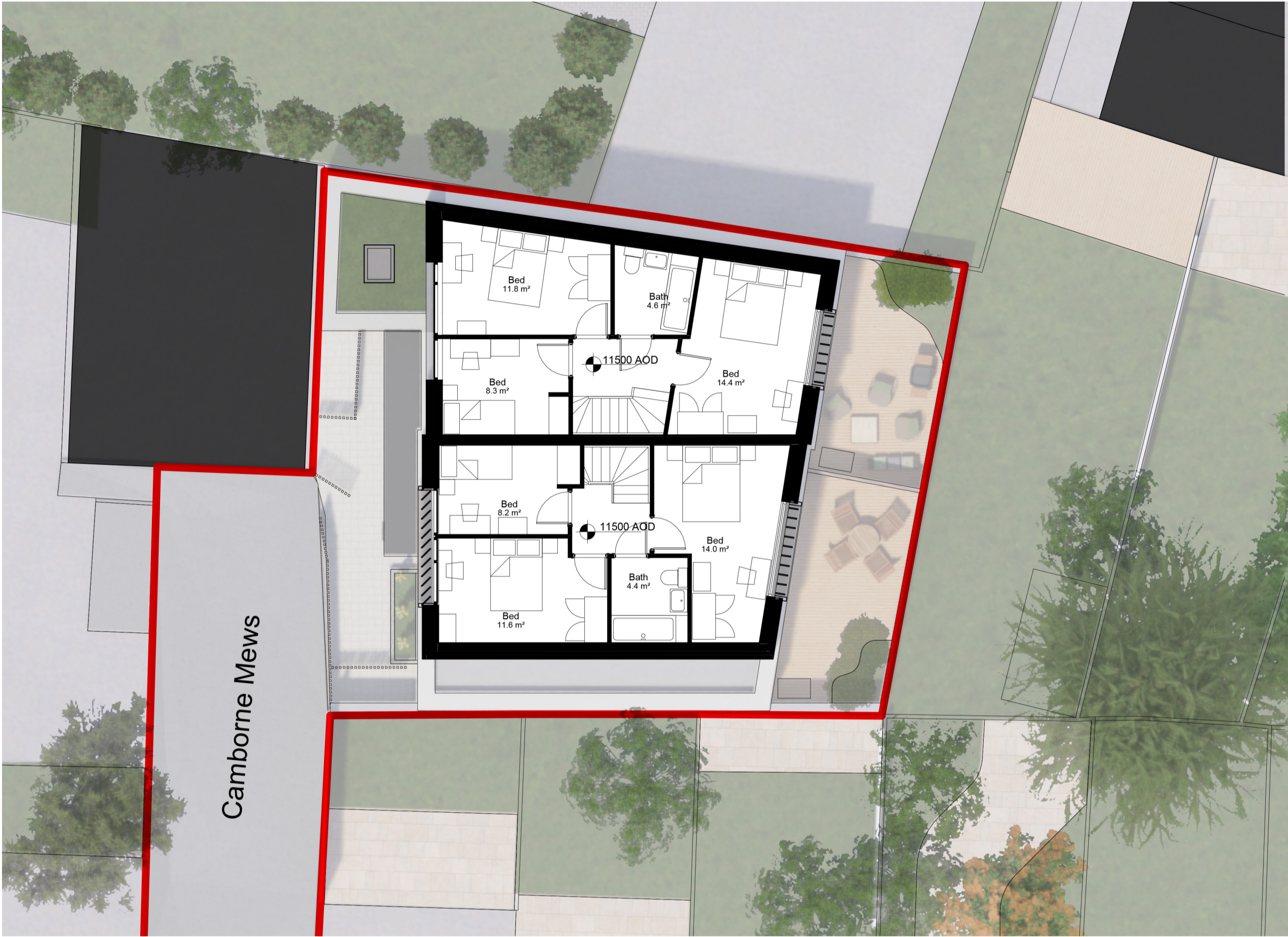
② L01 - Proposed 1st Floor Plan 1 : 100