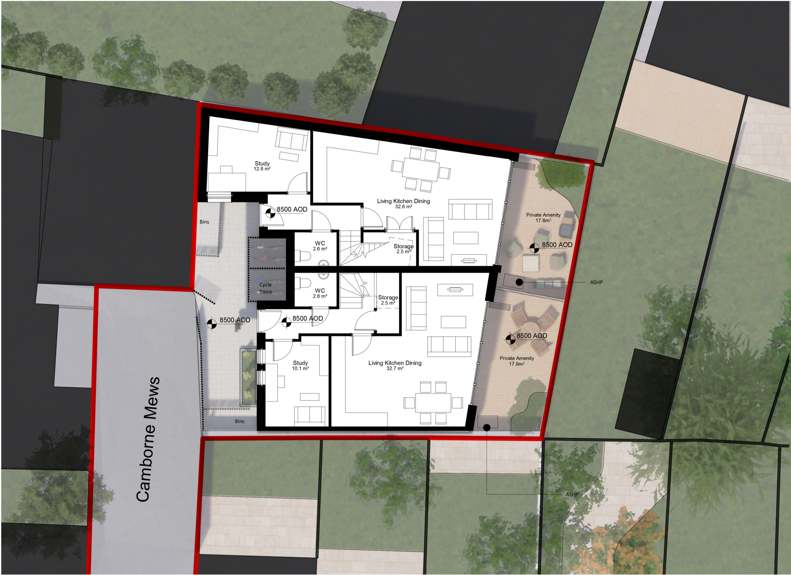
① L00 - Proposed GF Plan 1 : 100