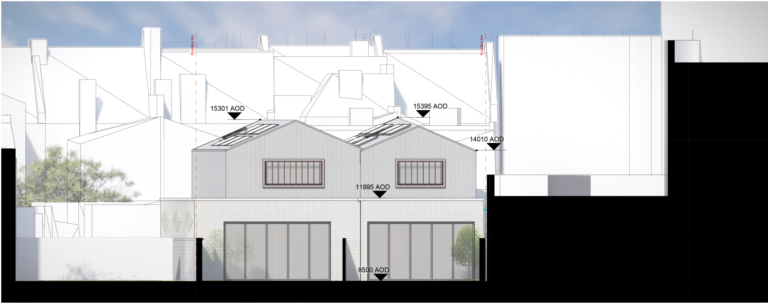
① Proposed East Elevation 1 : 100