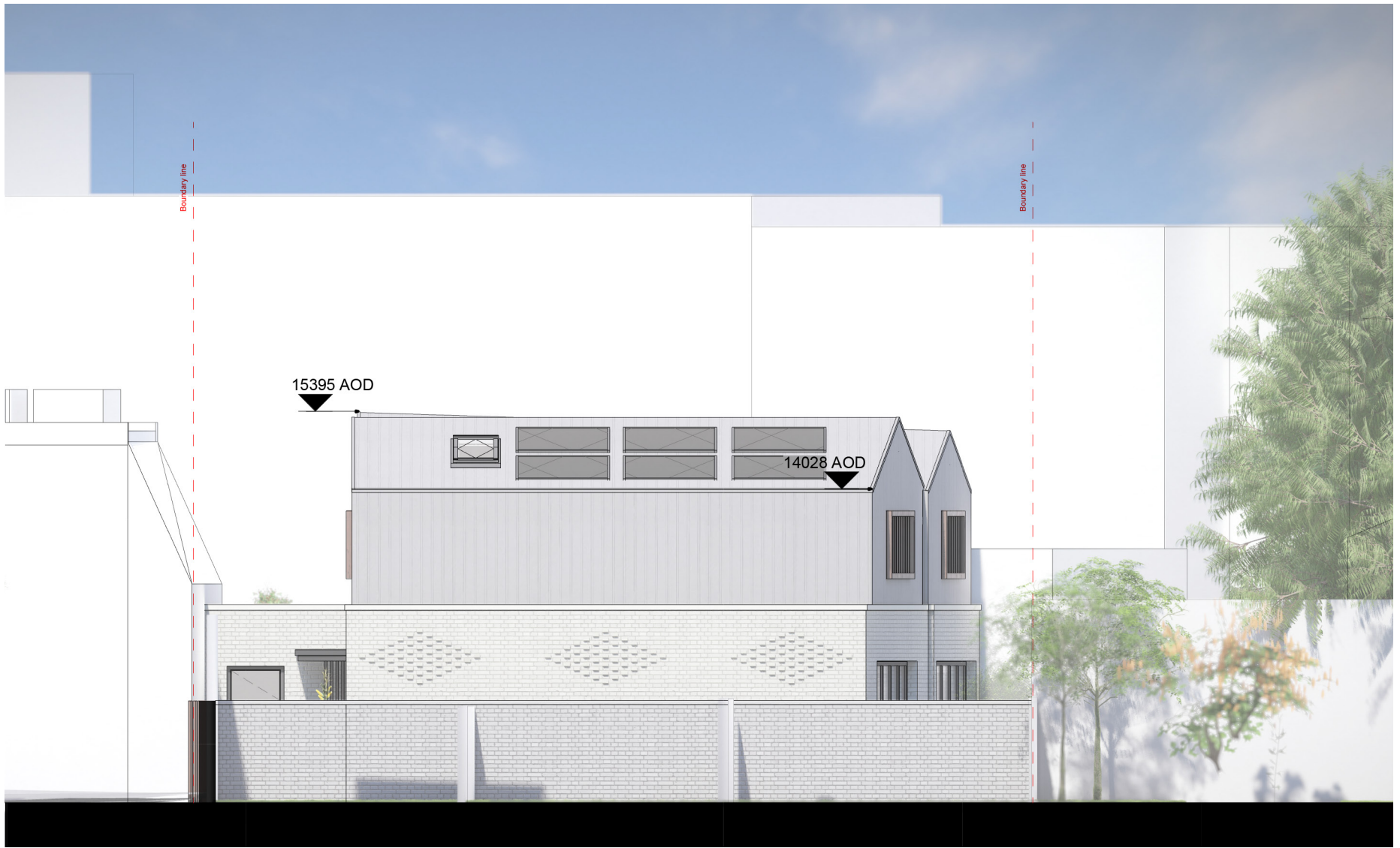
③ Proposed South Elevation 1 : 100