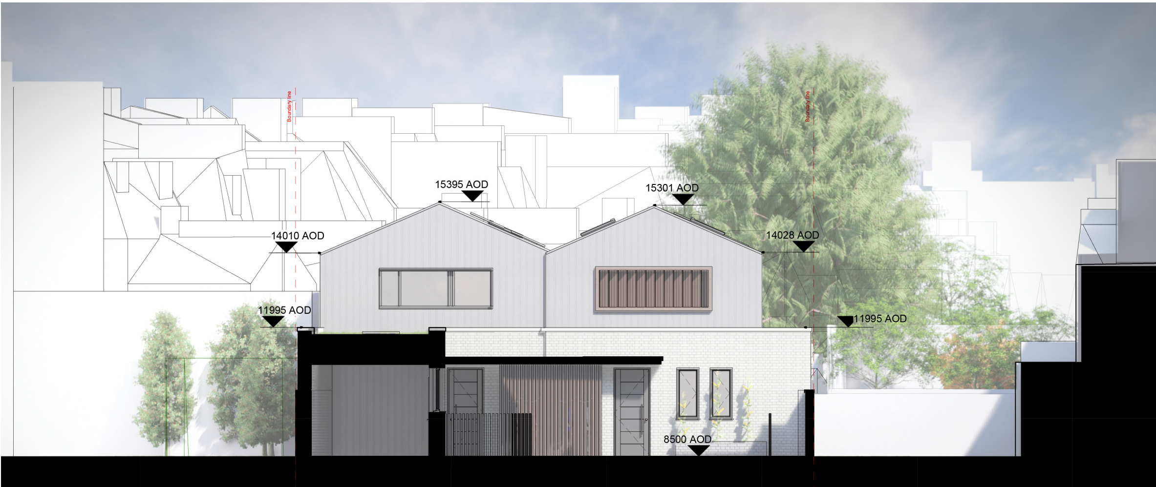
④ Proposed West Elevation 1 : 100