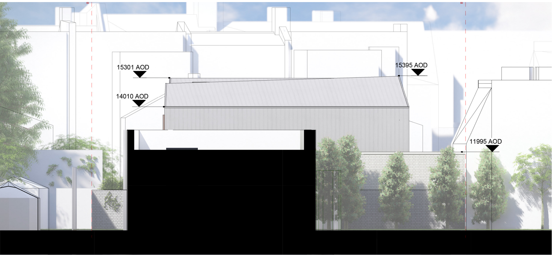
② Proposed North Elevation 1 : 100