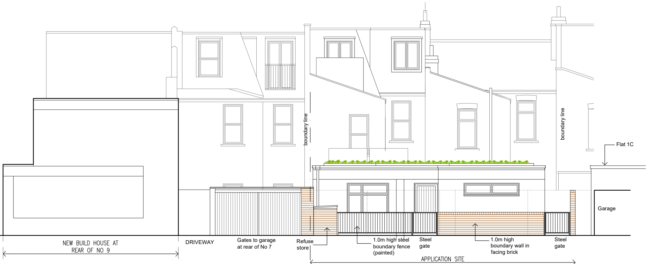
PROPOSED FRONT BOUNDARY (SOUTH) ELEVATION