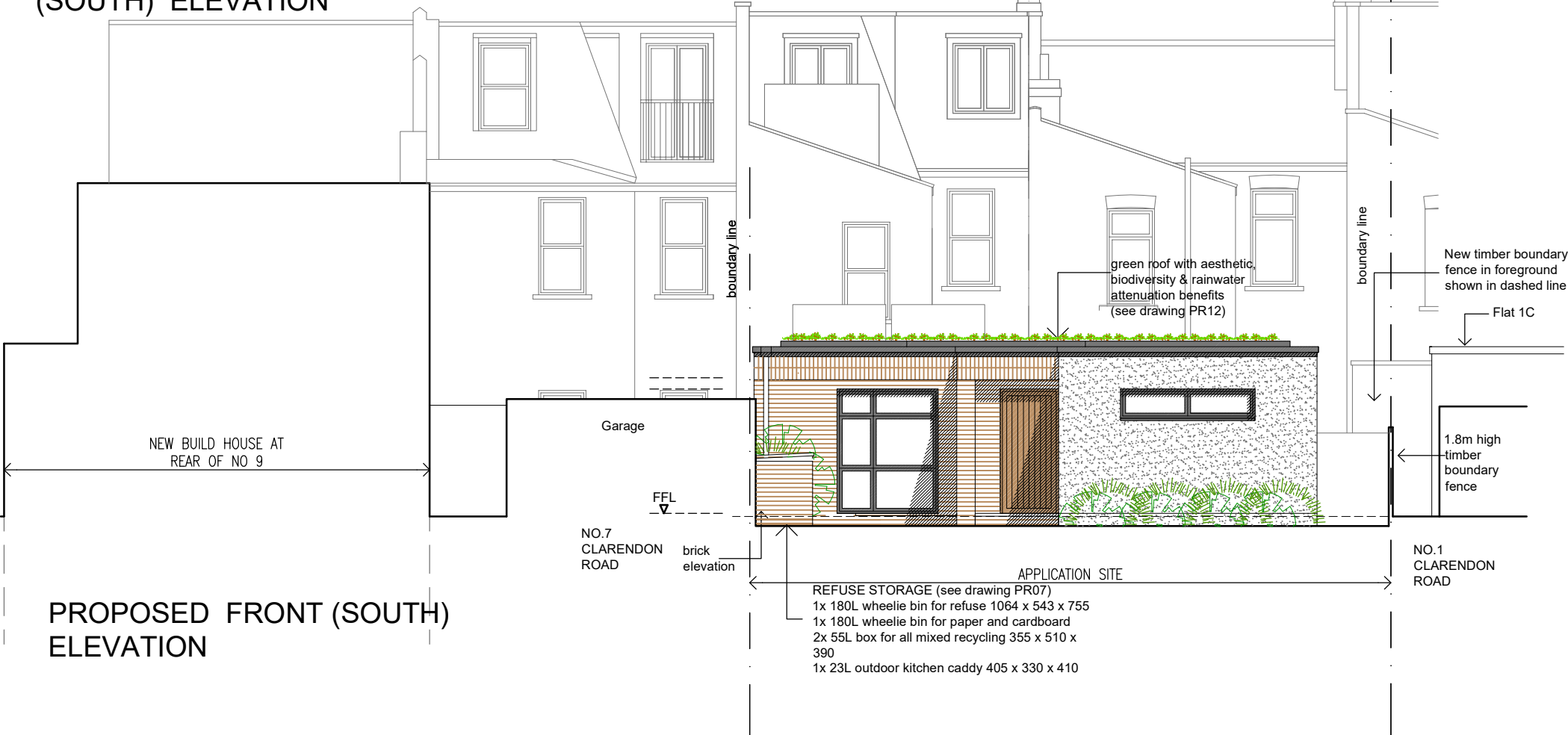
PROPOSED FRONT (SOUTH) ELEVATION