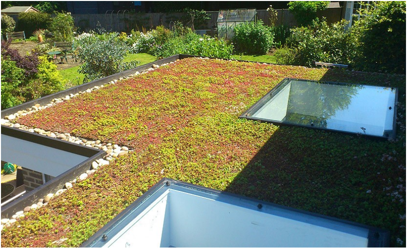
EXAMPLE OF SEDUM ROOF (Aesthetic, biodiversity & rainwater attenuation, see drawing PR04 for further details)

All dimensions are to be checked on site. All dimensions are in millimetres. All Discrepancies are to be reported to the architect immediately. Drawings marked "planning" or "design" are not to be used for construction purposes. Drawing is to be read with the schedule of work / specification if applicable This drawing is Copyright of J7 Architecture Ltd.